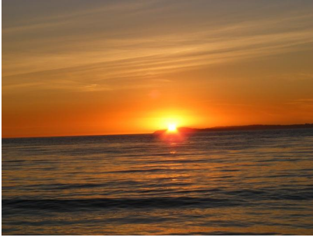
Sunset, Laguna Beach, CA